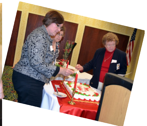
Alpha Kappa State Birthday Celebration