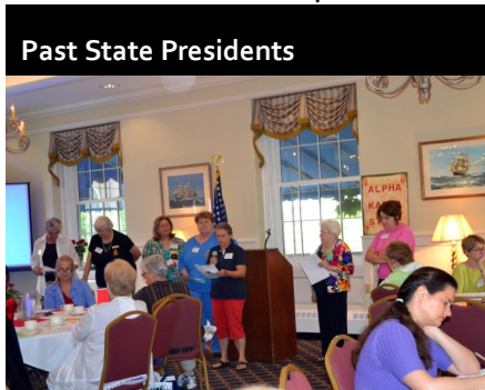
Past State Presidents

Past State Presidents presented the role of our chapters as Am-