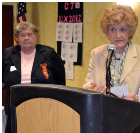
Communication Committee Awards