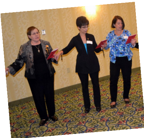
Closing DKG Song