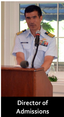
Director of Admissions

There was a brief overview by the Director of the Admissions of the Coast Guard Academy with some very in-