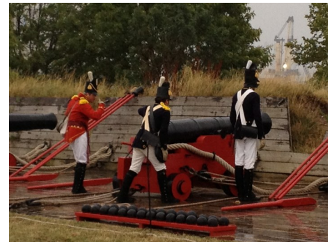
Historical re-enactors fire the cannon at Ft. McHenry, Baltimore

At the Brooklyn Navy Yard Center, a docent-lead tour will show you the dry docks where ships such as the Monitor and the Maine were built in the 19 th century, and tell you the story of women and immigrants who worked in the yard building ships during World War II. The yard now provides space for small business. All buildings are now LEED certified and many of the businesses use recycled materials and are interdependent on each other. One such building creates counter tops from recycled glass.