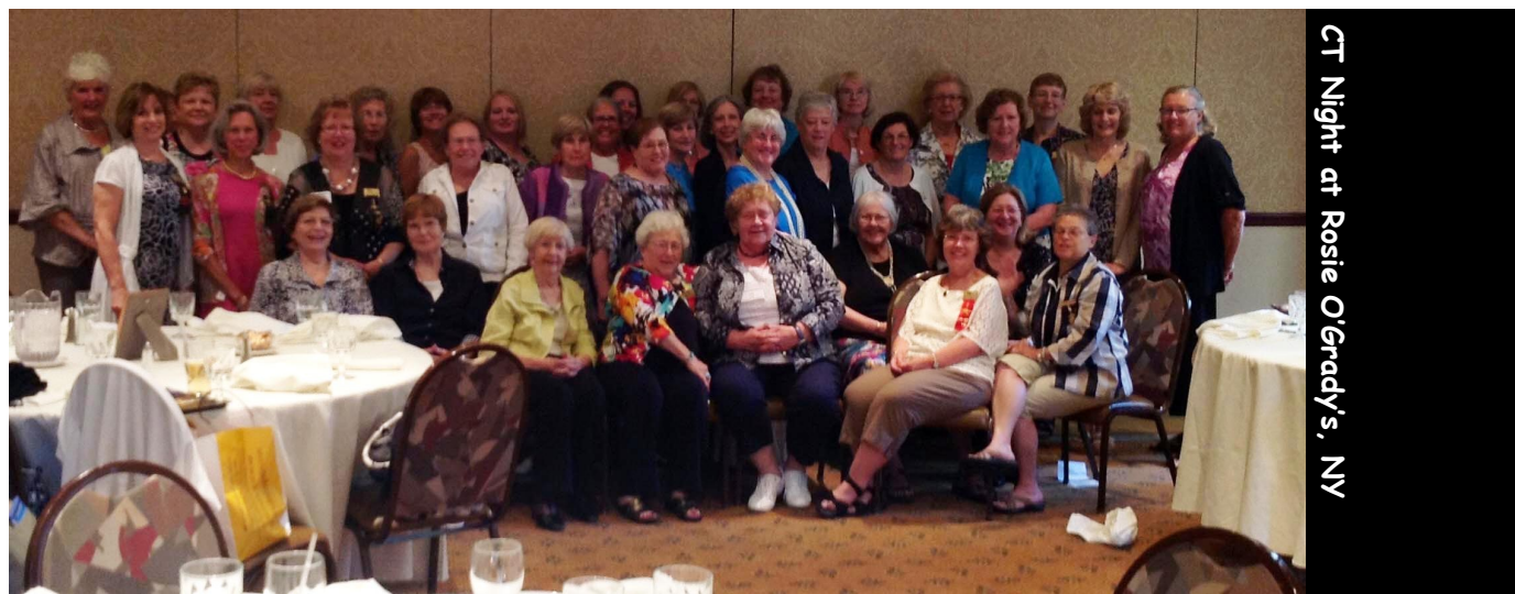
CT Night at Rosie O'Grady's, NY

Watch for the next issue of the DKG News where all the convention actions will be described. Consider attending the Northeast Regional Conference next July in Portland Maine, a nice drive from Connecticut. By then we will have three International events in succession in the Northeast. How fortunate can we get?